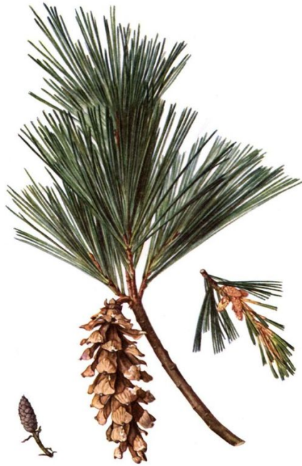
WHITE PINE Pinus strobus L. PINE FAMILY